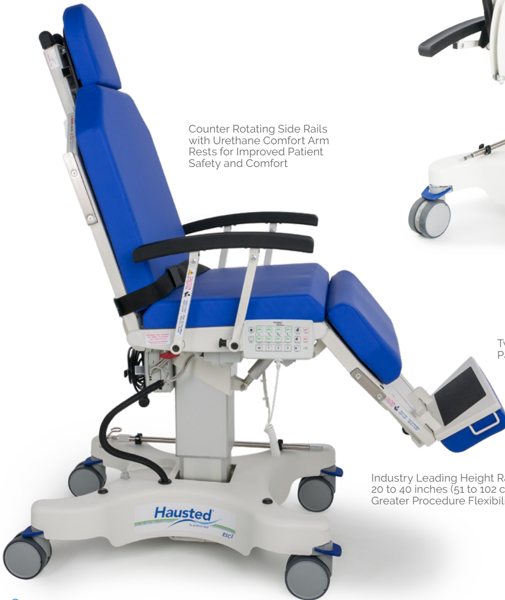
Industry Leading Height Range – 20 to 40 inches (51 to 102 cm) for Greater Procedure Flexibility